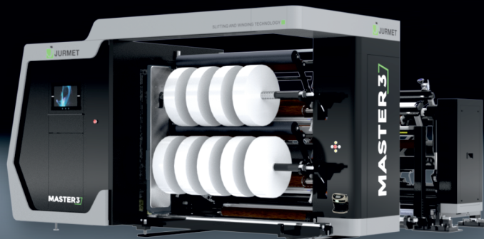
MASTER3 Duplex slitter with separate unwind and rewind station